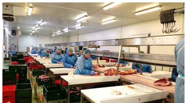
Deboning line incl. transport of crates