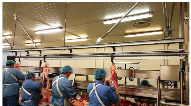
Hanging deboning of legs