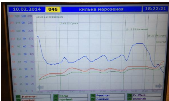
Graphical recording of the process